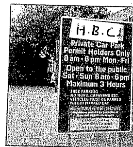
Parking is still free in small car park behind Town Hall at weekends